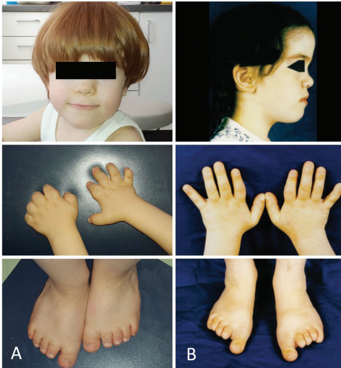
Figure 1. Photographs of the face, hands, and feet of patient 1 at the age of 3 years (A) and patient 2 at the age of 8 years (B). Note the facial dysostosis with flattening of the nasal bridge and the small broad hands and feet with relative sparing of the first toe [Figure 1B reproduced with permission of Springer (17)]

time of presentation. His weight was 12.8 kg (5.4 th percentile, SDS -1.61) with a body mass index of 15.6 kg/m 2 (51.6 th percentile, SDS +0.04). Radiographic examination showed severe brachydactyly with shortening of metacarpals, metatarsals and phalanges, except for the big toe, cone-shaped epiphyses, and a significantly advanced bone age (Figure 2A). Laboratory investigations showed normal results, except for a mildly elevated TSH of 7.98 mU/L, while thyroid hormone levels were normal.