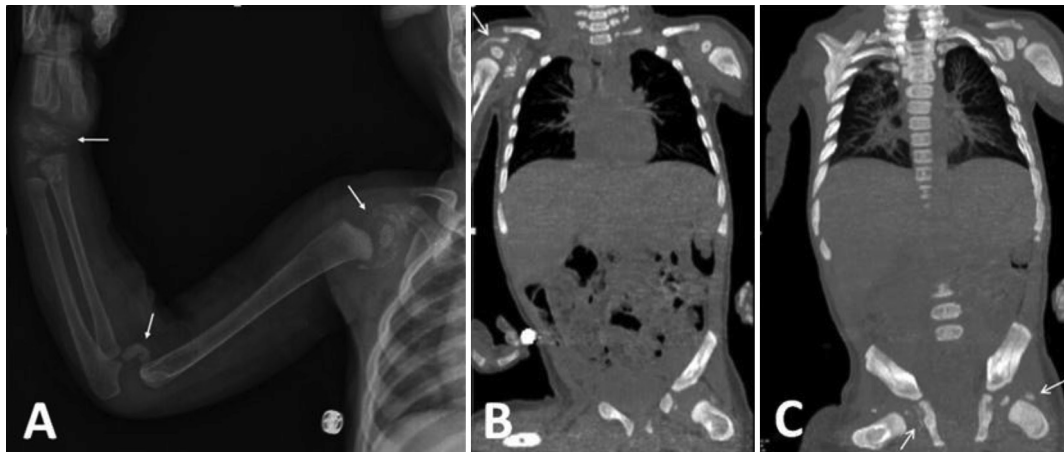
Figure 2. At age nine months, radiograph before magnesium and anti-phosphate treatment, A) Radiograph shows progression of periarticular calcification in the right shoulder, elbow and wrist joint, B) Coronal non-contrast computed tomography of abdomen demonstrates periarticular calcification in the right shoulder joint, and C) shows periarticular calcification in right hip joint

was a significant clinical improvement in joint functions and motor development. At the most recent examination of the patient, at the age of 23 months, his weight was 10 kg (-1.93 SD), height was 85 cm (-0.7 SD), arterial blood pressure measurements were normal, joint movements were comfortable and neuromotor development was improving. The etidronate treatment was stopped and magnesium