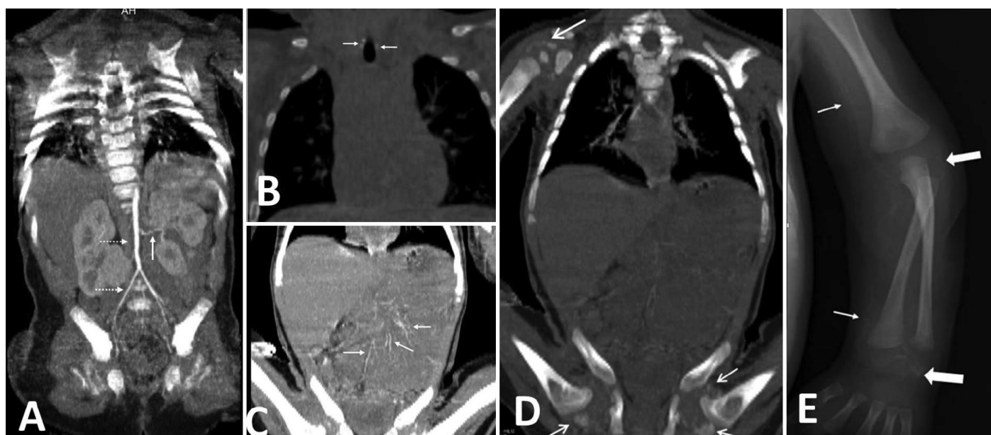
Figure 1. At age three months, coronal non-contrast computed tomography of abdomen and chest, A) Diffuse narrowing is seen in bilateral renal arteries, abdominal aorta and bilateral iliac arteries, B) At the level of the larynx, soft tissue calcifications are observed in the paratracheal region and around the hyoid bone, C) There are linear hyperdensities consistent with calcification in the mesenteric artery and branches, D) Periarticular calcification in the right shoulder joint and in the right hip joint, E) At age three months, on baseline radiograph; the left wrist shows arterial calcification of the brachial and radial arteries (thin arrow) and intra- and peri-articular calcifications in left elbow and wrist joints (thick arrow)

Intravenous disodium pamidronate was administered as three doses on days 0, 7 and 10. On the fifth day of pamidronate treatment, oral etidronate was initiated at a dose of 10 mg/kg/day which was increased to 20 mg/kg/day after three days. After six months of etidronate treatment, calcifications on direct radiographs and CT persisted (Figure 2A, 2B, 2C) as well as intermittent swelling and restriction of joints. This suggested an inadequate response to biphosphonate treatment. Calcium carbonate treatment at a dose of 250 mg twice a day and magnesium oxide treatment 150 mg twice a day were started with a simultaneous reduction in Etidronate to a dose of 10 mg/kg/day. While calcium, phosphorus and other laboratory parameters were normal at baseline (Table 1), serum phosphorus concentration decreased following the anti-phosphate treatment, as expected. After the initiation of calcium carbonate and magnesium treatment, restriction and swelling of the joints gradually improved. No adverse effects were experienced in the follow-up period. A marked decrease of calcifications was seen in the radiographs which were taken during the sixth month of treatment. Calcium carbonate and magnesium treatments were continued while etidronate was further reduced to a dose of 5 mg/kg/day.