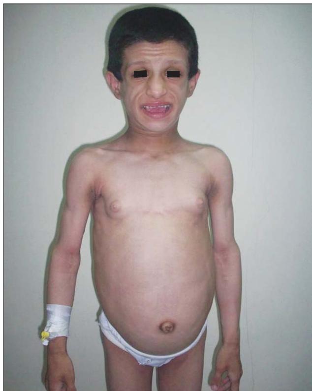
Figure 1. General appearance of the patient, note the coarse face, generalized loss of subcutaneous fat, prominent muscularity, and protuberant abdomen

On physical examination, the patient's weight (23 kg) and height (117 cm) were above the 97 th percentile. Her weight for height was normal. She was mentally dull. She had coarse facial features with generalized loss of subcutaneous fat and prominent muscularity (Figure 1). Her