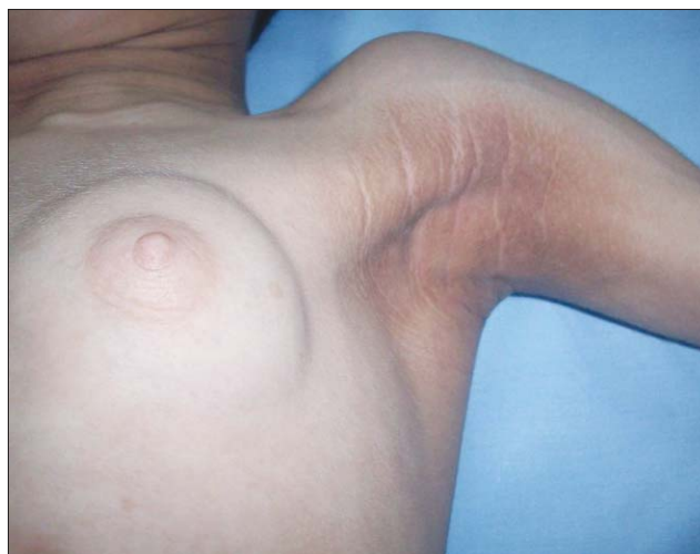
Figure 3. Note the acanthosis nigricans on the axilla and pseudothelarche